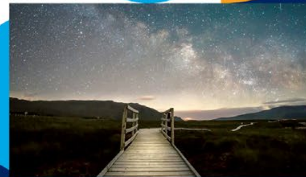
MAYO DARK SKY PARK