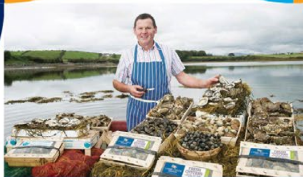
CROAGH PATRICK SEAFOOD TOURS