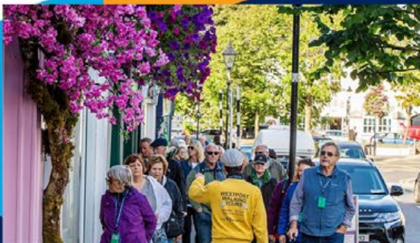
WESTPORT WALKING TOURS