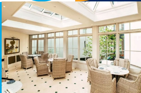
PARK TERRACE WINE BAR