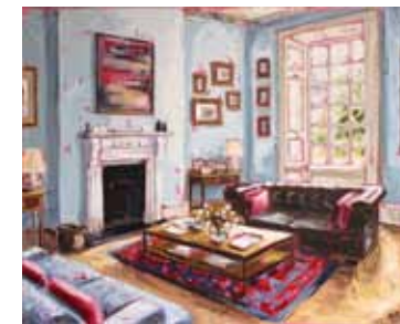
TITLE: My Thoughts Escaping MEDIA: Oil on canvas YEAR: 2015 Nº: Pc023 LOCATION: Park Terrace Wine Bar