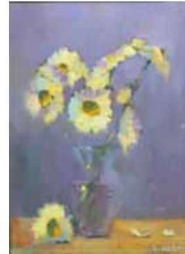
TITLE: Summer Scent MEDIA: Oil on Canvas YEAR: 1994 Nº: Pc014