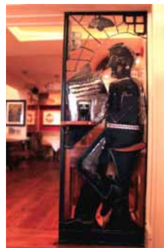
TITLE: A Pint A Day MEDIA: Metal YEAR: 1998 Nº: Mw070 LOCATION: JW's Brasserie-Bar