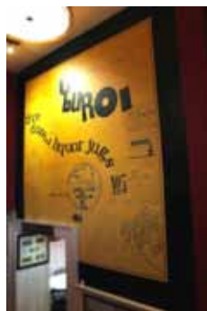
TITLE: Mural 4: From Durer's Renaissance drawings to contemporary typographical exercises