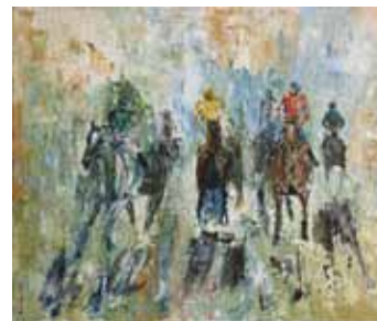
TITLE: Unknown MEDIA: Oil on canvas YEAR: After 2003 Nº: Pc010 LOCATION: Park Terrace Wine Bar