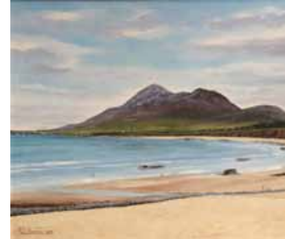
TITLE: The Reek from Old Head MEDIA: Oil on canvas YEAR: 2012 Nº: Pc028 LOCATION: Central Hallway