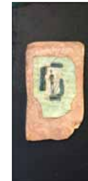
TITLE: The Land Pulling Away MEDIA: Ceramic YEAR: 1998 Nº: C075 LOCATION: JW's Brasserie - Green Room