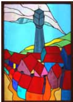
TITLE: Tryptich - The Famine3 MEDIA: Stained Glass YEAR: 1995 Nº: G101