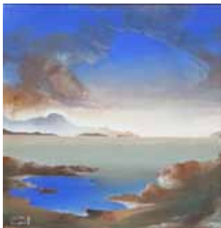
TITLE: Beara Light / Beara Inspiration MEDIA: Oil on canvas YEAR: 2016 Nº: Pc017 LOCATION: Park Terrace Wine Bar