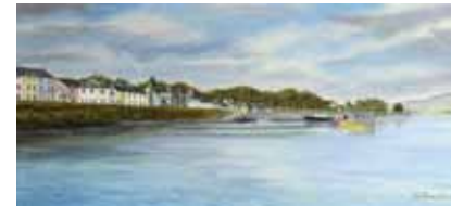
TITLE: Roundstone Harbour MEDIA: Oil on canvas YEAR: 2011 Nº: Pc083 LOCATION: JW's Brasserie - Red Room