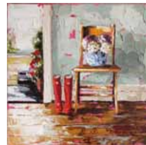
TITLE: Love's Glory MEDIA: Oil on canvas YEAR: 2016 Nº: Pc011 LOCATION: Park Terrace Wine Bar