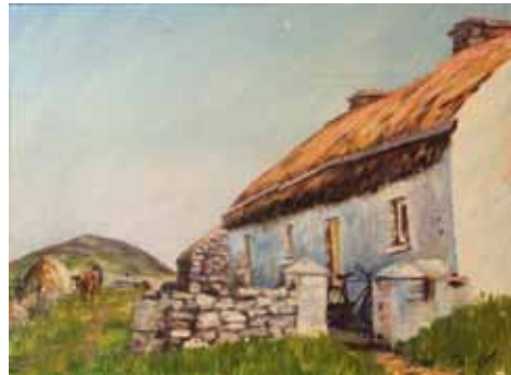
TITLE: Askilloun Louisburgh MEDIA: Oil on canvas YEAR: 1998 Nº: Pc060 LOCATION: Cobbler's Bar