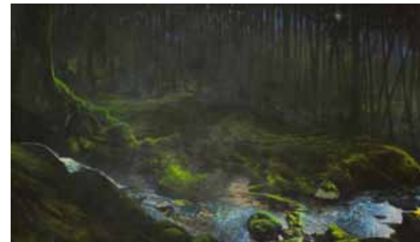
TITLE: River by the Moonlight MEDIA: Oil on canvas YEAR: 1997 Nº: Pc036 LOCATION: Central Hallway