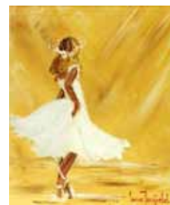
TITLE: Ballet in White MEDIA: Oil on Canvas YEAR: Unknown Nº: Pc003 LOCATION: Lobby & Reception Area