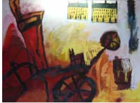
TITLE: Your Own Fellow MEDIA: Oil on canvas YEAR: 1999 Nº: Pc108