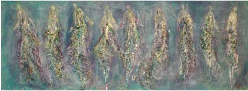
TITLE: Ladies Day MEDIA: Oil on canvas YEAR: 2016 Nº: Pc046 LOCATION: The Lane Suite