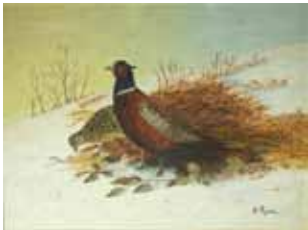
TITLE: Pheasants MEDIA: Oil on canvas YEAR: Unknown Nº: Pc038 LOCATION: The Lane Suite