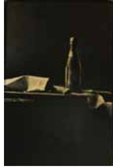
TITLE: Guinness I MEDIA: Photograph YEAR: Unknown Nº: PH068