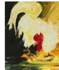
TITLE: Cockerel MEDIA: Oil on Canvas YEAR: Unknown Nº: Pc025 LOCATION: Central Hallway