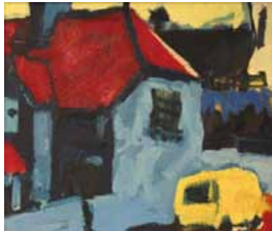
TITLE: Joyces MEDIA: Oil on canvas YEAR: 1998 Nº: Pc072