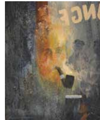
TITLE: Unknown MEDIA: Oil on canvas YEAR: Unknown Nº: Pc086 LOCATION: JW's Brasserie - Red Room