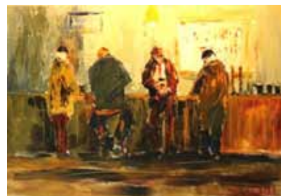
TITLE: A quiet pint MEDIA: Oil on Canvas YEAR: Unknown Nº: Pc081 LOCATION: JW's Brasserie - Green Room