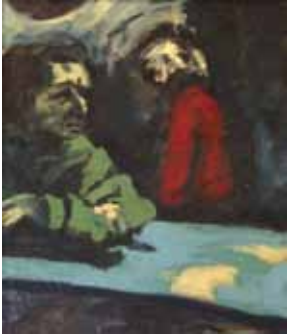
TITLE: Laughing MEDIA: Oil on canvas YEAR: 1992 Nº: Pc073