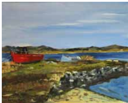
TITLE: Red Boat Monastery Quay Roundstone MEDIA: Oil on canvas YEAR: Unknown Nº: Pc041 LOCATION: The Lane Suite