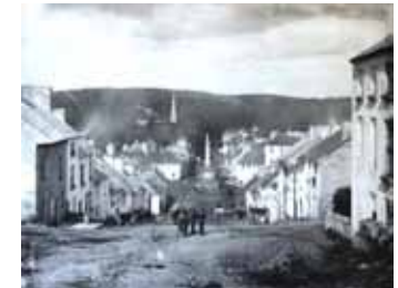
TITLE: Peter Street, Westport MEDIA: Photograph YEAR: 1904 Nº: PH050 LOCATION: Main Stairwell