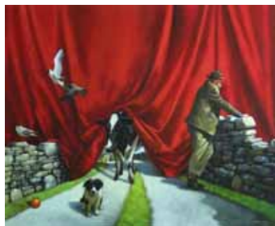
TITLE: All the worlds a stage MEDIA: Print YEAR: Original made in 2004 Nº: PR059 LOCATION: Cobbler's Bar