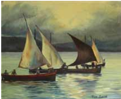
TITLE: Unknown MEDIA: Oil on canvas YEAR: Unknown Nº: Pc032 LOCATION: Central Hallway

Born in Hertfordshire, England in 1947 and at the age of 22 he moved to Westport. Over the years he has been renowned for his portraits, but he concentrates on landscape painting.