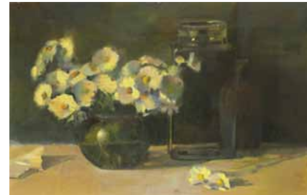
TITLE: Dinner Guests MEDIA: Oil on Canvas YEAR: 1994 Nº: Pc007 LOCATION: Lobby & Reception Area