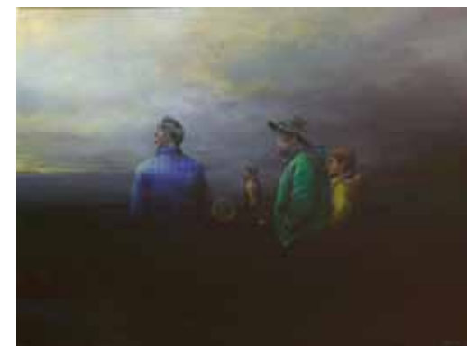
TITLE: Day's End MEDIA: Acrylic and pencil on Canvas YEAR: 2018 Nº: Pc040 LOCATION: The Lane Suite