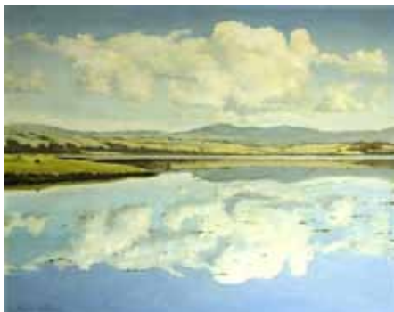
TITLE: Lough Swilly, Co. Donegal MEDIA: Oil on canvas YEAR: 1965 Nº: Pc048 LOCATION: The Lane Suite