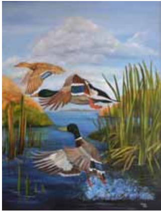
TITLE: None MEDIA: Oil on canvas YEAR: 2016 Nº: Pc033 LOCATION: Central Hallway