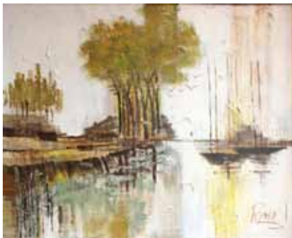
TITLE: Unknown MEDIA: Oil on canvas YEAR: Unknown Nº: Pc037 LOCATION: Central Hallway

Dutch painter and artist. Biography unknown.