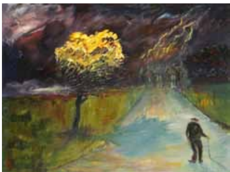
TITLE: Haunted House MEDIA: Oil on Canvas YEAR: Unknown Nº: Pc080 LOCATION: JW's Brasserie - Green Room