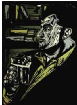
TITLE: Brendan Belich MEDIA: Linocut on Paper YEAR: 1998 Nº: Ep082 LOCATION: JW's Brasserie - Red Room