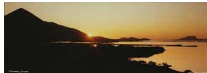
TITLE: November Sunset MEDIA: Photography YEAR: November 1993 Nº: PH029 LOCATION: Central Hallway