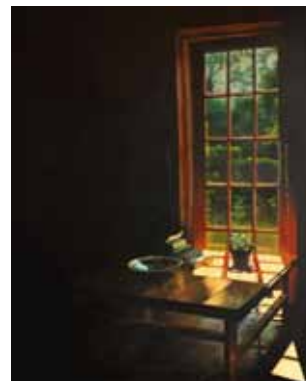
TITLE: Tree, Books and Door MEDIA: Oil on canvas YEAR: 1997 Nº: Pc045 LOCATION: The Lane Suite