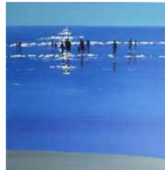
TITLE: Shallow water, Inch Beach MEDIA: Oil/Acrylic on canvas YEAR: 2018 Nº: Pc044 LOCATION: The Lane Suite