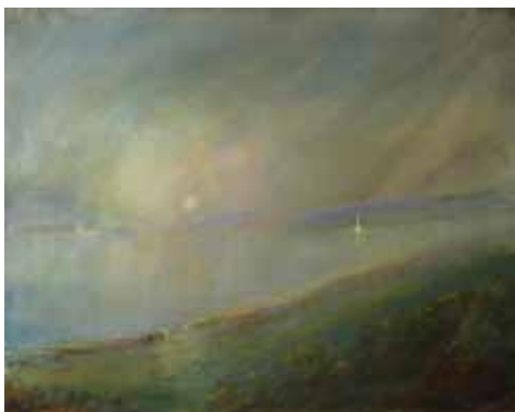
TITLE: Coast MEDIA: Oil on Canvas YEAR: Unknown Nº: Pc001 LOCATION: Lobby & Reception Area