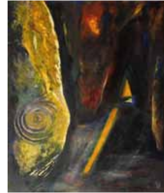
TITLE: Newgrange MEDIA: Oil on canvas YEAR: Unknown Nº: Pc084 LOCATION: JW's Brasserie - Red Room