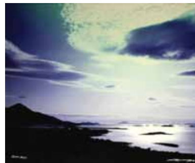
TITLE: Clew Bay MEDIA: Photography YEAR: July 1997 Nº: Pc030 LOCATION: Central Hallway