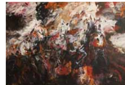
TITLE: Unknown MEDIA: Oil on canvas YEAR: After 2003 Nº: Pc005 LOCATION: Lobby & Reception Area