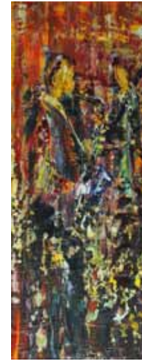
TITLE: A Love Supreme MEDIA: Oil on Canvas Board YEAR: 2008 Nº: Pc019 LOCATION: Park Terrace Wine Bar