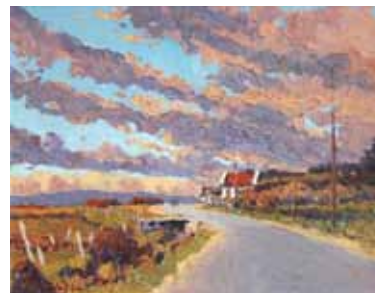
TITLE: On the way to the golden strand. Evening Sky MEDIA: Oil on canvas YEAR: 2015 Nº: Pc016 LOCATION: Park Terrace Wine Bar