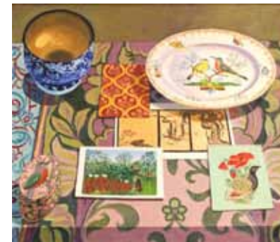
TITLE: Unknown MEDIA: Oil on canvas YEAR: 1996 Nº: Pc027 LOCATION: Central Hallway