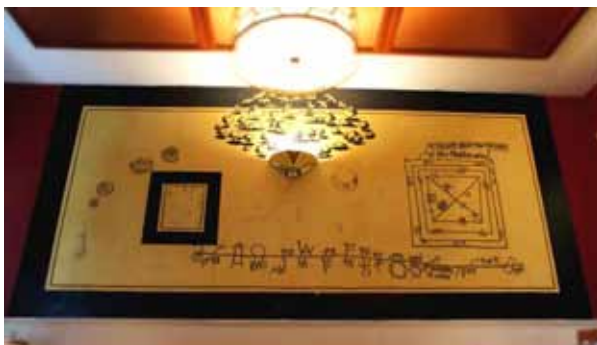
TITLE: Mural 1: Ogam alphabet from the Book of Ballymote and Irish archaeological artefacts