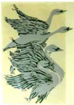
TITLE: Children of Liz MEDIA: Woodcut on Paper YEAR: 1992 Nº: Ep078 LOCATION: JW's Brasserie - Green Room