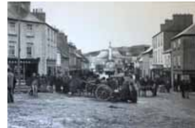
TITLE: Shop Street, Westport MEDIA: Photograph YEAR: 1904 Nº: PH052 LOCATION: Main Stairwell