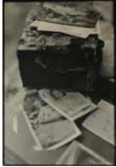
TITLE: Memories MEDIA: Photograph YEAR: Unknown Nº: PH067