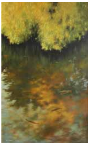
TITLE: The Galway Canal MEDIA: Oil on canvas YEAR: 1986-88 Nº: Pc021 LOCATION: Park Terrace Wine Bar