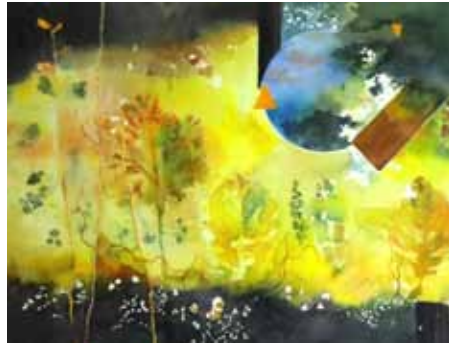
TITLE: Unknown MEDIA: Watercolour on Paper YEAR: Unknown Nº: Pp062 LOCATION: Cobbler's Bar