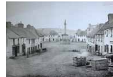
TITLE: Peter Street looking to Clendenning Monument, Westport MEDIA: Photograph YEAR: 1904 Nº: PH008 LOCATION: Lobby & Reception Area