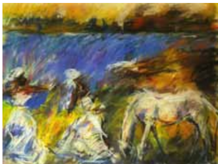
TITLE: White horse and dancers MEDIA: Pastel on Paper YEAR: Unknown Nº: Dp026 LOCATION: Central Hallway