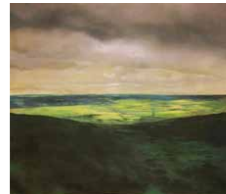
TITLE: Towards Westport MEDIA: Oil on canvas YEAR: 2006 Nº: Pc002 LOCATION: Lobby & Reception Area