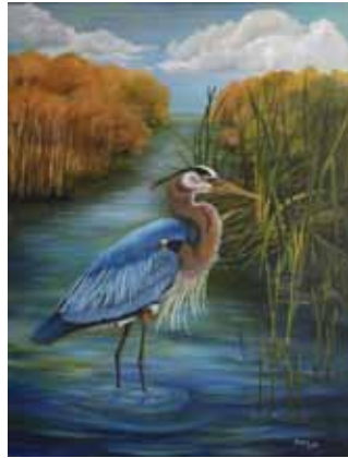
TITLE: None MEDIA: Oil on canvas YEAR: 2016 Nº: Pc035 LOCATION: Central Hallway