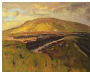
TITLE: Autumn in Achill MEDIA: Oil on Canvas Board YEAR: 1991 Nº: Pc022 LOCATION: Park Terrace Wine Bar