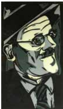
TITLE: Joyce in the late 30s MEDIA: Linocut on Paper YEAR: 1999 Nº: Ep076 LOCATION: JW's Brasserie - Green Room