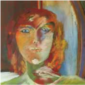
TITLE: Red Head MEDIA: Pastels on Paper YEAR: Unknown Nº: Dp090 LOCATION: JW's Brasserie - Red Room