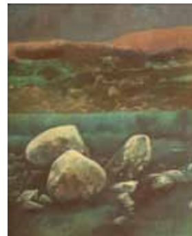
TITLE: Ox Rocks MEDIA: Oil on canvas YEAR: 1989 Nº: Pc089 LOCATION: JW's Brasserie - Red Room

His work has been exhibited widely and features in public nationally and internationally.