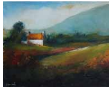
TITLE: Summer Fields MEDIA: Oil on canvas YEAR: 2015 Nº: Pc018 LOCATION: Park Terrace Wine Bar

A full time artist originally from Dublin, and now based in Achill Island. His paintings are inspired by the untamed landscapes and coastline of Ireland's Wild Atlantic Way. Achill Island has had a profound influence on his paintings. His work seeks to elicit the emotion that allows room for the viewer to get lost in the subject.