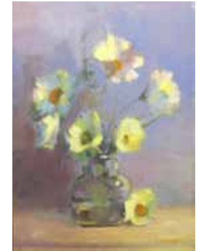
TITLE: Morning Light MEDIA: Oil on Canvas YEAR: 1994 Nº: Pc013