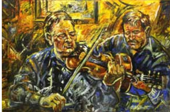
TITLE: Session MEDIA: Oil on Canvas YEAR: Unknown Nº: Pc053