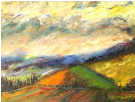
TITLE: Faraway Hills MEDIA: Oil on Canvas YEAR: Unknown Nº: Pc024 LOCATION: Park Terrace Wine Bar