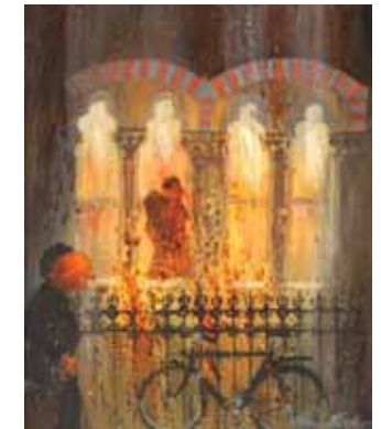
TITLE: Unknown MEDIA: Oil on canvas YEAR: Unknown Nº: Pc085 LOCATION: JW's Brasserie - Red Room