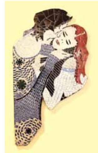
TITLE: The Kiss MEDIA: Mosaic YEAR: Around 2000 Nº: MS064 LOCATION: JW's Brasserie - Bar