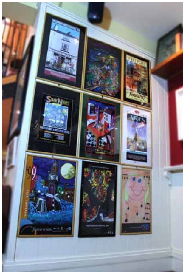
TITLE: Westport Arts Festival Posters MEDIA: Poster YEAR: Through the years Nº: PR065 LOCATION: JW's Brasserie

We invite you to take a look around JWs Restaurant and Brasserie to discover more of them.