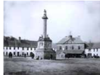
TITLE: Clendenning Monument, the Octagon, Westport MEDIA: Photograph YEAR: 1904 Nº: PH049 LOCATION: Main Stairwell

Most of this collection is made up of people, topographical views and interior views throughout Ireland. Included in the main reading room of the National Library of Ireland.