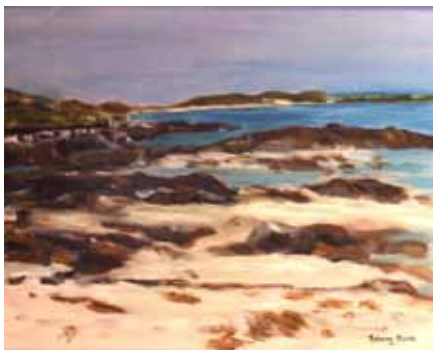
TITLE: Bun Oven Bay, Connemara MEDIA: Oil on canvas YEAR: 2015 Nº: Pc058 LOCATION: Jw's Brasserie-Lower Ground