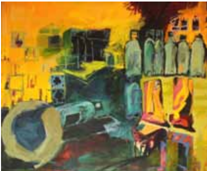
TITLE: The Game MEDIA: Oil on canvas YEAR: 1999 Nº: Pc107