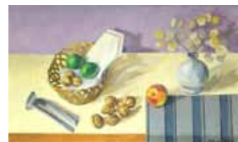
TITLE: Unknown MEDIA: Oil on canvas YEAR: 1996 Nº: Pc043 LOCATION: Central Hallway