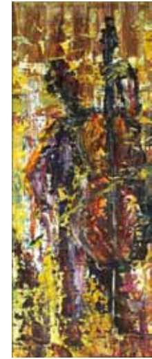
TITLE: Black Market MEDIA: Oil on Canvas Board YEAR: 2008 Nº: Pc020 LOCATION: Park Terrace Wine Bar