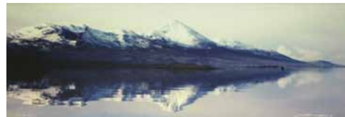
TITLE: Winter Reek MEDIA: Photography YEAR: February 1989 Nº: PH031 LOCATION: Central Hallway