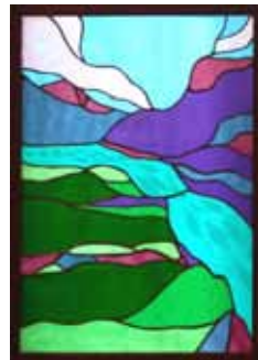
TITLE: Tryptich - The Famine1 MEDIA: Stained Glass YEAR: 1995 Nº: G100