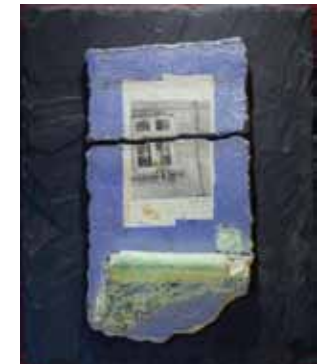
TITLE: All the Kings Horses MEDIA: Ceramic YEAR: 1998 Nº: C071 LOCATION: JW's Brasserie - Bar