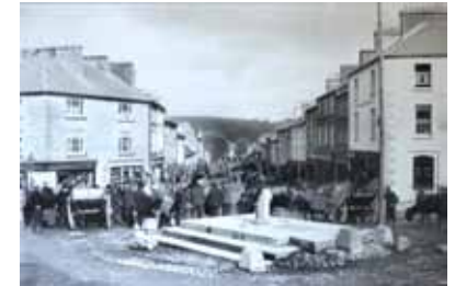
TITLE: Bridge Street, Westport MEDIA: Photograph YEAR: 1904 Nº: PH051 LOCATION: Main Stairwell