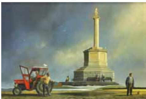
TITLE: Coveys on the Octagon MEDIA: Oil on canvas YEAR: 2006 Nº: Pc058 LOCATION: Cobbler's Bar

His work has been likened to the surrealism. "As warm and fantastic as a good dream".