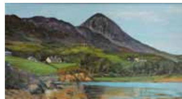
TITLE: Unknown MEDIA: Oil on canvas YEAR: Unknown Nº: Pc034 LOCATION: Central Hallway

Born in England, he moved to Murrisk in the 1950s, where he specialized on landscapes about the West Coast of Ireland.