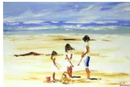
TITLE: Building Sandcastles MEDIA: Oil on Canvas YEAR: Unknown Nº: Pc039 LOCATION: The Lane Suite