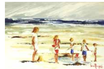
TITLE: Beach scene MEDIA: Oil on Canvas YEAR: Unknown Nº: Pc004 LOCATION: Lobby & Reception Area