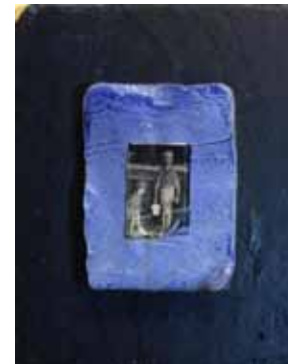
TITLE: Pig Latin MEDIA: Ceramic YEAR: 1998 Nº: C069 LOCATION: Jw's Brasserie - Bar