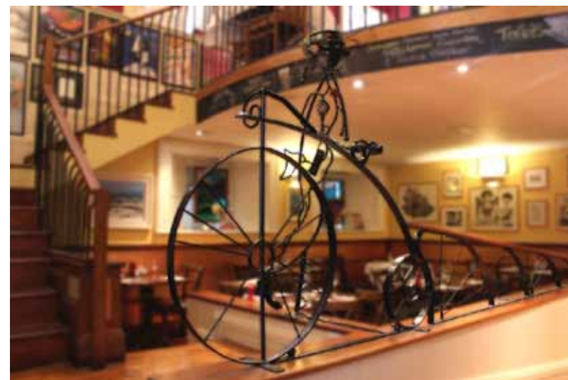
TITLE: Aton Man MEDIA: Metal YEAR: 1998 Nº: Mw103 LOCATION: JW's Brasserie-Lower Ground

Local metalwork artists based in Castlebar Co. Mayo. The pieces were commissioned by the owner of the hotel in 1998.