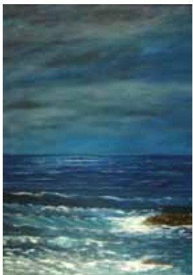
TITLE: Breaking waves MEDIA: Oil on canvas YEAR: Unknown Nº: Pc057 LOCATION: Cobbler's Bar

His inspiration comes from his surroundings in the West of Ireland. He has exhibited throughout Ireland, UK, North America, Canada, and South Africa.