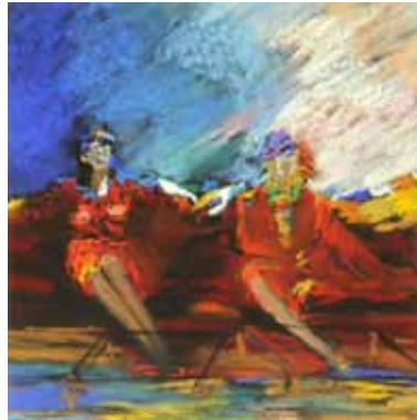
TITLE: Unknown MEDIA: Pastels on Paper YEAR: Unknown Nº: Dp063 LOCATION: JW's Brasserie - Bar