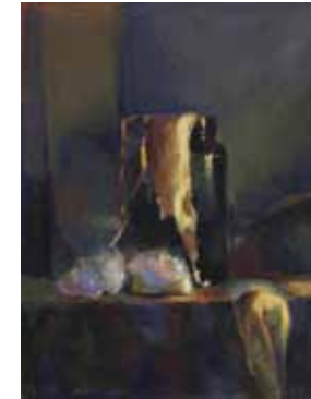
TITLE: The Malt Jar MEDIA: Oil on Canvas YEAR: 1993 Nº: Pc006