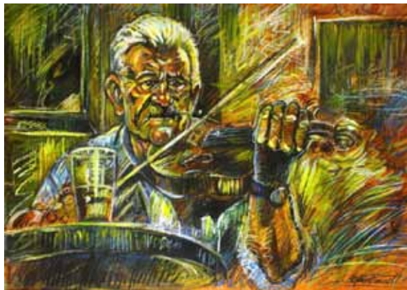
TITLE: The fiddler MEDIA: Pastel on Paper YEAR: Unknown Nº: Dp079 LOCATION: JW's Brasserie - Green Room