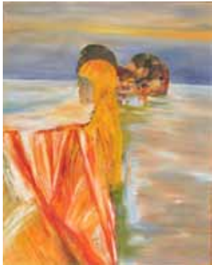
TITLE: Taja MEDIA: Oil on board YEAR: 1999 Nº: Pp012 LOCATION: Park Terrace Wine Bar