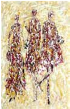
TITLE: Friends MEDIA: Oil on canvas YEAR: Unknown Nº: Pc047 LOCATION: The Lane Suite