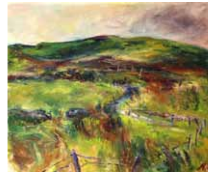
TITLE: Towards Lough Easkey MEDIA: Oil on canvas YEAR: 2010 Nº: Pc042 LOCATION: The Lane Suite